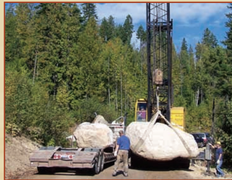
▲ Amazing efforts have been taken to orchestrate the roads and internal infrastructure in an unobtrusive manner. Onsite natural resources hide culverts, utilities and other amenities in place.