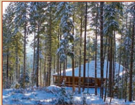
▲ Site planning aims to have no house visible by another. Architectural guidelines encourage the blending of all buildings and outbuildings into the natural settings