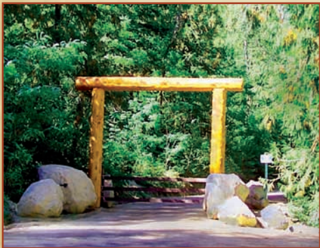
▲ The Ridge at Sandpoint is a gated community. The gate, although high-tech and substantial, is subtle to passersby while providing security and privacy to homeowners.